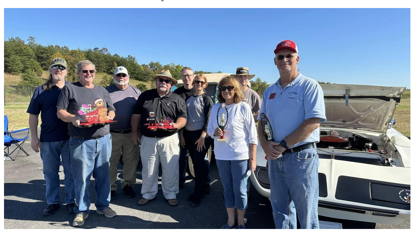
HFR at Toys for Tots Car Show on 19 Oct.