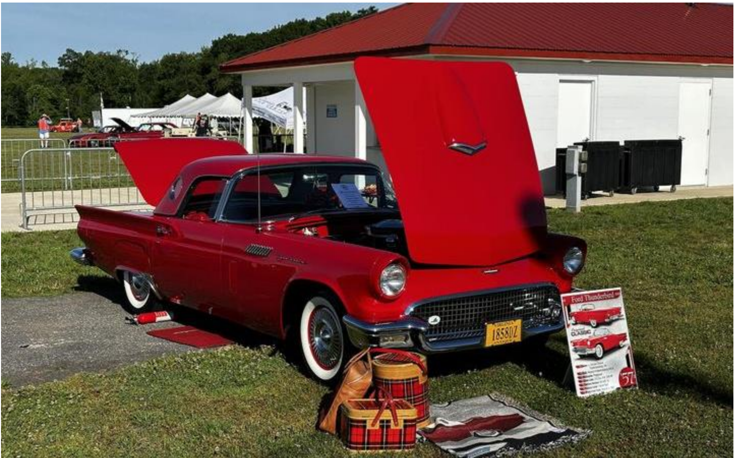
Two of the over 100 cars at 67 th Annual HFR Car Show