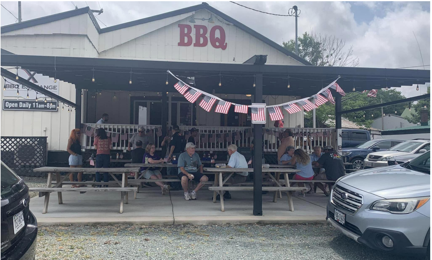
HFR at BBQ Exchange in Gordonsville